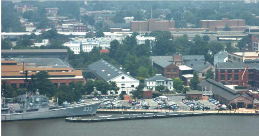
Washington Navy Yard: Home of the NHF, NHHHC and the National Museum of the U.S. Navy

The Naval Historical Foundation provided $886,888.00 in 2012 to support Navy, Naval History and Heritage Command (NHHHC), and National Museum of the United States Navy history and heritage programs. Examples of support include assistance to the U.S. Naval Academy to update battle/campaign names along interior facings of Navy-Marine Corps Memorial Stadium; staffing contributions for the NHHHC Professional Development Workshop; donations of numerous books, photographs, oral histories, and other artifacts to the Navy Department Library and NHHHC curator; and funding of Navy Museum programs through proceeds generated by the NHF-operated Navy Museum Store.