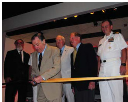
Admiral Holloway, seen cutting the ribbon, was embarked in USS Newport News (CA 148) as Commander 7 th Fleet during the battle in Haiphong Harbor.