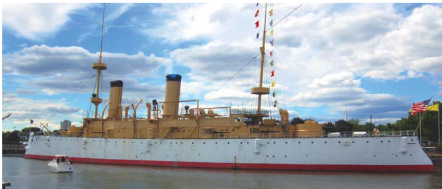
The cruiser Olympia has been offered for transfer by the Independence Seaport Museum.

The Naval Historical Foundation provided $886,888.00 in 2012 to support Navy, Naval History and Heritage Command (NHHHC), and National Museum of the United States Navy history and heritage programs. Examples of support include assistance to the U.S. Naval Academy to update battle/campaign names along interior facings of Navy-Marine Corps Memorial Stadium; staffing contributions for the NHHHC Professional Development Workshop; donations of numerous books, photographs, oral histories, and other artifacts to the Navy Department Library and NHHHC curator; and funding of Navy Museum programs through proceeds generated by the NHF-operated Navy Museum Store.