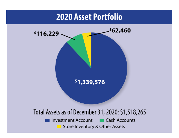
Note 1. Received $62,600 of Paycheck Protection Program loan funding in April of 2020. The loan was forgiven in April of 2021. Note 2. The Investment Account increased by $130,045.00 in 2020.

On the expenses side of the ledger, our largest obligations were programs such as generating book reviews and other postings of naval historical interest; publishing Pull Together ; maintaining websites to promote NHF, the Navy Museum Store, and IJNH ; administering our recognition programs to acknowledge scholarship; maintaining NHF's oral history and memoir collections; and responding to inquiries regarding naval history. Our second largest expense involved administrative support to maintain our computer networks and office infrastructure as well as our annual audit. COVID